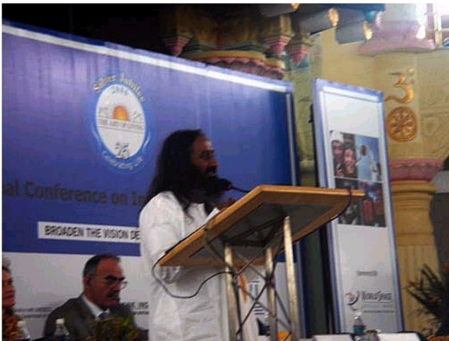
Sri Sri Ravi Shankar addresses his welcome message at the Meeting

The need to increase the educational budget was a major and recurring thought particularly of developing countries (India, Sri Lanka, Africa). The interest of the political authorities,