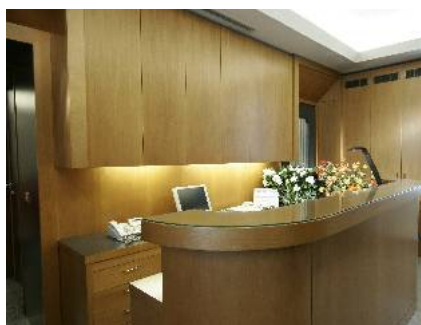
Reception at the Smiline Stress Clinic