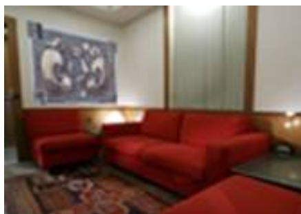
One of the Waiting Rooms at the Smiline Stress Clinic

The Stress Clinic aims to help in the maintenance, promotion and restoration of physical, mental and affective wellbeing. It promotes both the use of conventional and non conventional therapeutic strategies in an overall concept of integrated medicine. Natural approaches of proven effectiveness such as exercise (Vickers Douglas K., www.mayoclinic.com ), chronotherapy (Wirz Justice A., Psychological Medicine , 2005), cold water therapy (Ciancaglini, Veicsteinas, 2003; Martini, 2005) ( www.smiline.net/ASSC ), can be suggested as therapeutic options instead of, or in conjunction with medication.