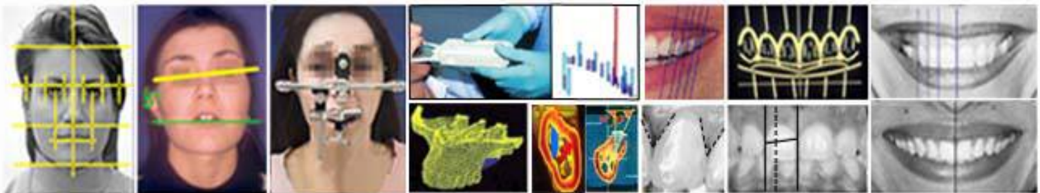
The face project: anatomical markers and clinical evaluation

Oral diseases (teeth an guns) can seriously affect your wellness (cardiovascular diseases, hypertension).