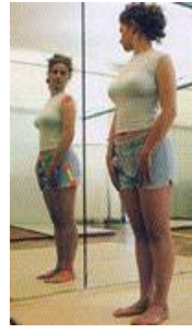
Somatic Postural analysis