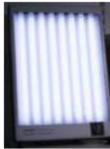
Equipment for Light Therapy