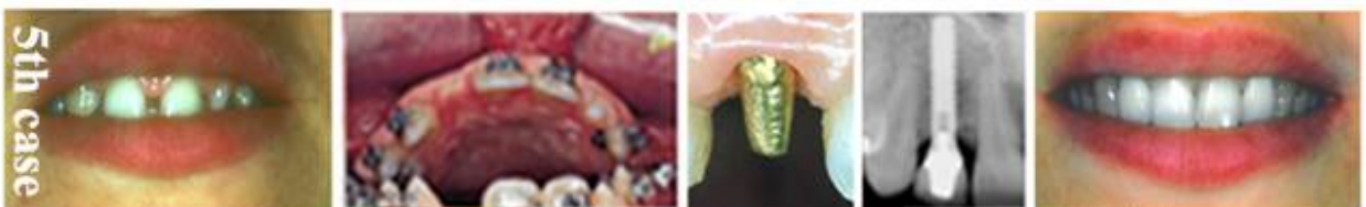
Poor aesthetics for agnesia of lateral incisor