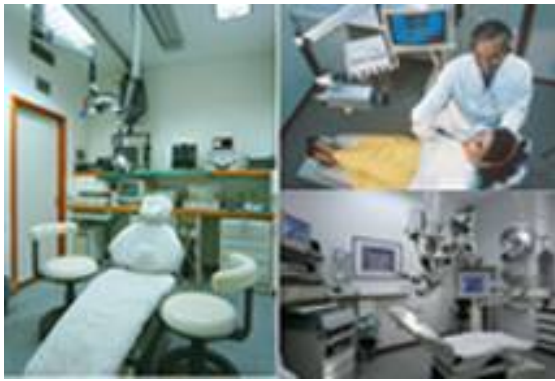
Equipment for the analysis of sleep disorders and for trigeminal musculoskeletal and neurological evaluation