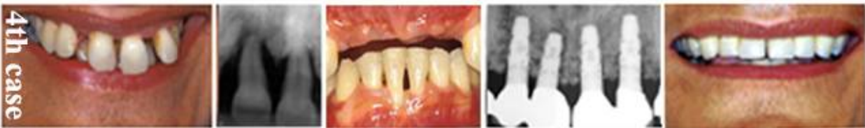
Poor aesthetic for severe periodontal breakdown and teeth migration