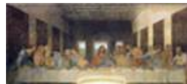
Milan, the City of Leonardo da Vinci *