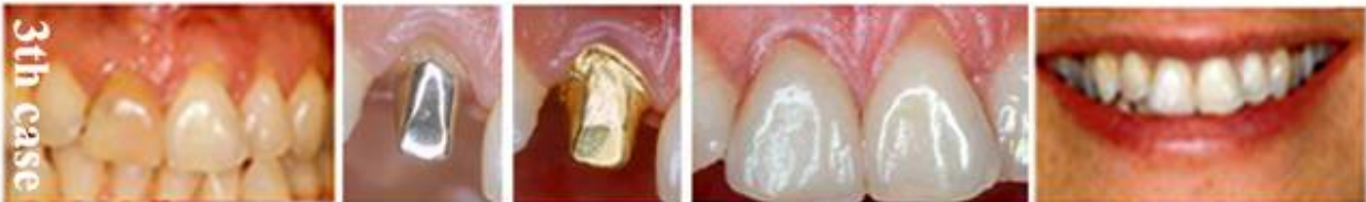
Discoloration of the central incisor